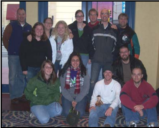
The Minot State students and staff who attended the Life Ops conferences pose for a picture after sharing a meal together.

Dear friends, as we prepare to finish up another semester, it's our delight to share more with you about how God is moving at Minot State!